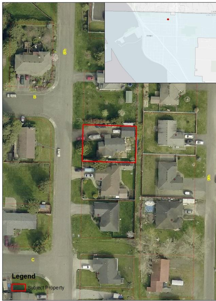
Figure 1: Vicinity Map